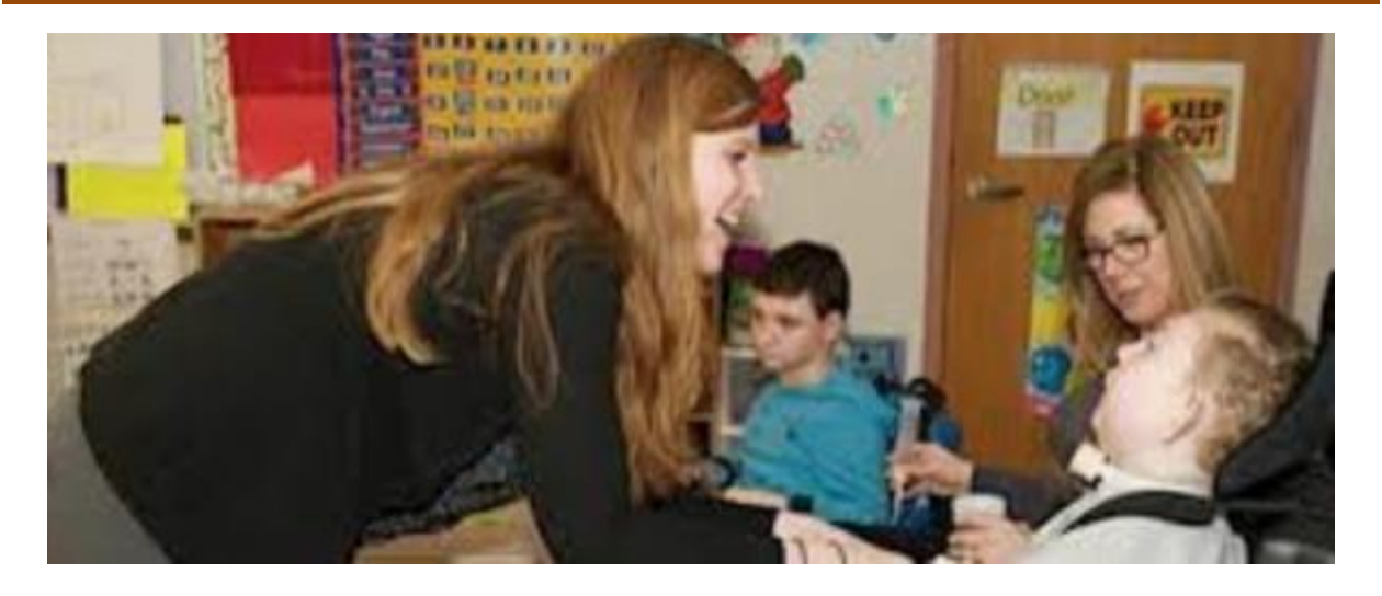
LABBB started with 305 students enrolled as of September 1, 2018